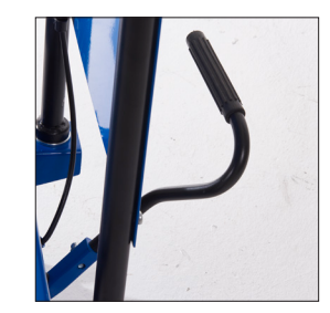
Manually operated via pump action foot pedal