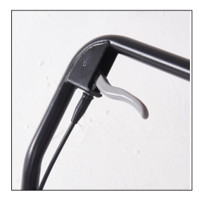
Slow release handle