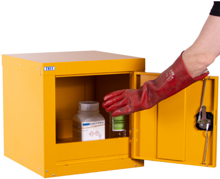
Fully Compliant to CoSHH

Our TUFF 45 is designed for the secure storage of hazardous substances and is fully CoSHH Compliant to meet regulations. It features a 13 Litre sump capacity to ensure maximum safety.