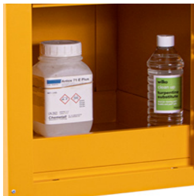
Sump capacity: 13 Litres